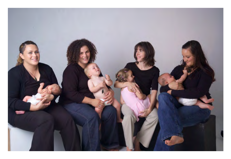
We would love photos of the your PCs or a PCP in action